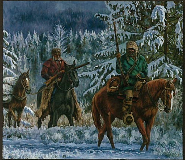
Robe Season (detail)