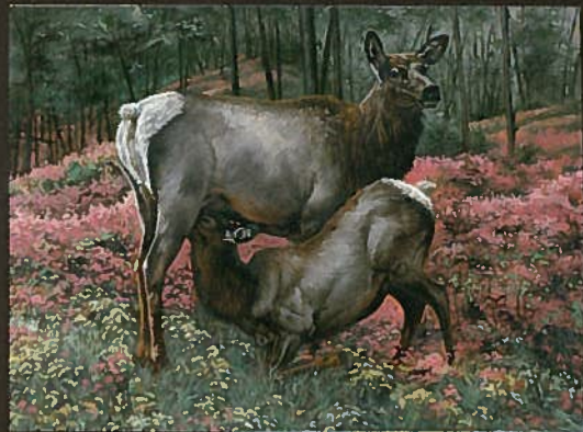
Time To Be Weaned oil on linen 18 x 24 inches